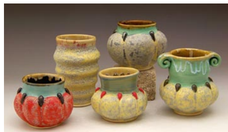
Works from Turtle Island Pottery

Turtle Island Pottery , 2782 Bat Cave Road, Old Fort. Ongoing - Featuring handmade pottery by Maggie and Freeman Jones, who create one of a kind, functional, decorative stoneware items. From cups to umbrella stands, mirror frames and clocks. Sculptural and inspired by nature, many forms are reminiscent of antique pottery from the arts and crafts movement and art nouveau styles. Hours: Showroom open most Saturdays, call ahead for any day of the week. Contact: 828/669-2713 or at ( www.turtleislandpottery.com ).