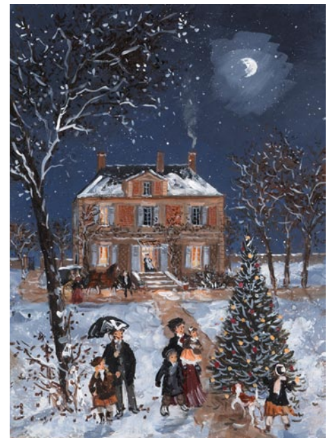
Work by Fabienne Delacroix

Flanders Gallery , 505 S. Blount Street, Raleigh. Ongoing - Flanders Gallery is committed to cultivating the careers of emerging artists. Through its rigorous exhibition program, the gallery continues to explore new concepts in contemporary art using various media. Flanders Gallery is dedicated to exhibiting provocative and innovative contemporary art, producing 14-18 exhibits each year both in the gallery and in alternative exhibit spaces. Hours: Wed.-Sat., 11am-6pm. Contact: 919/757-9533 or at ( http://flandersartgallery.com ).