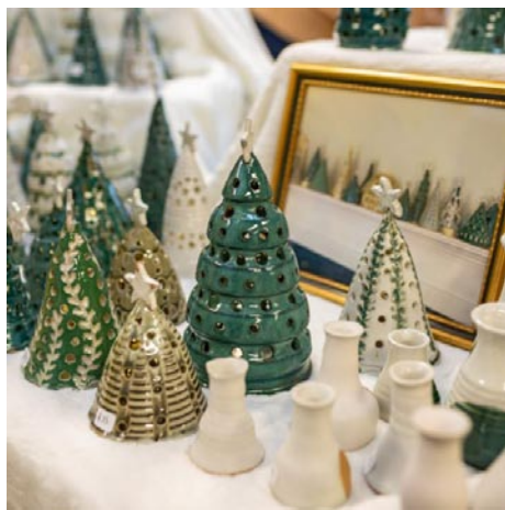
Works from a previous Holiday Market

Artists from across the region will offer a variety of handcrafted items, including ceramics, jewelry, textiles, painting, photography, and woodworking, making it easy to find something for everyone on your list.