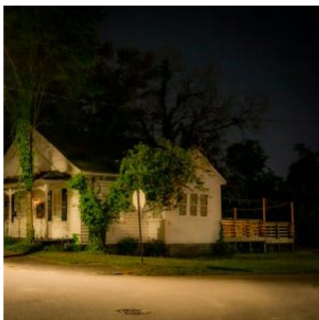
Work by Jeff Chase

"Once digital photography became the norm, I continued to advance my skills by learning Photoshop and Adobe Lightroom," adds Chase. "These tools have furthered the way photographers can use their photos to 'paint' imagery that they saw in their mind's eye, images that were only imagined while looking through the lens of a camera. This level of advancement has opened a new world for me, allowing me to not only capture images but also to interpret what I see. However, after all these years, I am still after the same thing – trying to capture a moment in time that has gone unnoticed by anyone else. It is truly a passion that will keep me fascinated the rest of my life."