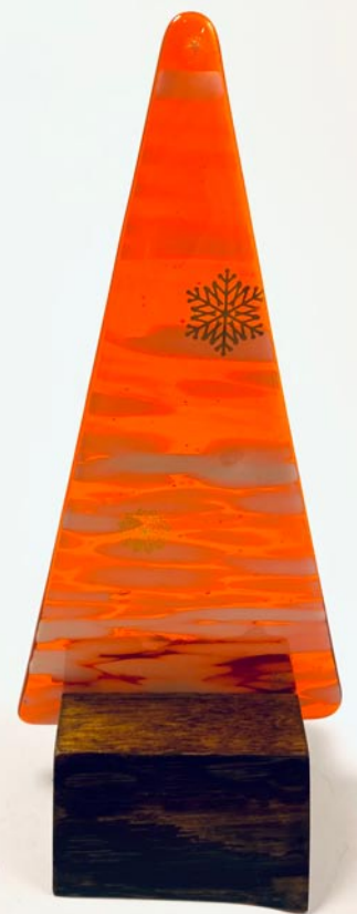
Fused glass Christmas Tree by Kakkie Honig

Happy Holidays from Sunset River Marketplace