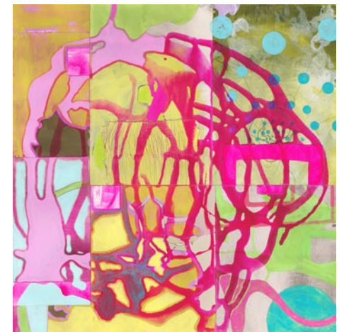
Work by Mary Robinson

this exhibition, Grand Strand Collects , the Museum presents more than 200 works of art varying from ancient Egyptian artifacts and historical prints to modern and contemporary sculpture and paintings, on loan from 49 private Grand Strand collections. For further information call the Museum at 843/238-2510 or visit ( www.MyrtleBeachArtMuseum.org ).