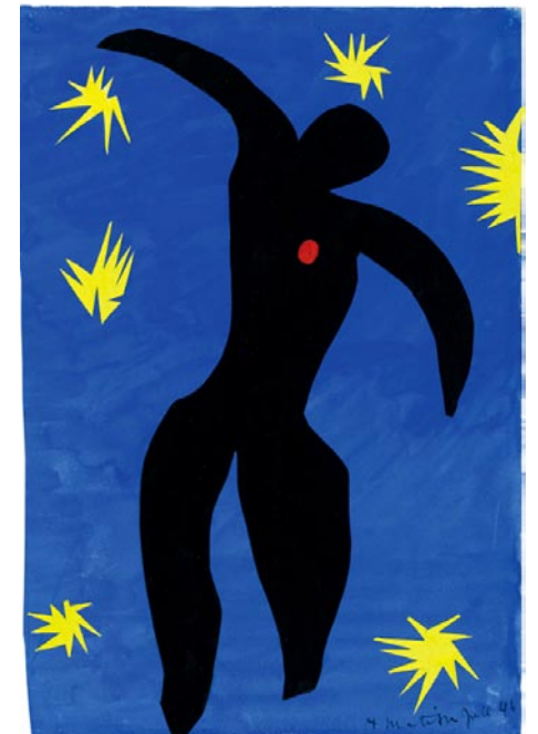
Work by Henri Matisse.

USC-Upstate in Spartanburg, SC, is presenting Finding Language , featuring art of Mary Robinson, whose dreamlike works evoke images of chaos and elemental forces, on view in the UPSTATE Gallery on Main, through Dec. 30, 2017. Drawing upon our complex and tumultuous relationship with nature, Robinson's artworks invoke both the fluidity of the natural world and the intermittent - and at times dramatic - reconfigurations due to natural disruption and renewal. Often mixing and remixing printmaking matrices along with cutting up and reconstructing prior paintings and drawings, the resulting enigmatic and dream-like images echo the interplay and chaos of elemental forces at work in the world around us. Robinson is an associate professor of art and head of printmaking at the University of South Carolina. For further information call Jane Nodine at 864/503-5848 or e-mail to ( jnodine@uscupstate.edu ).