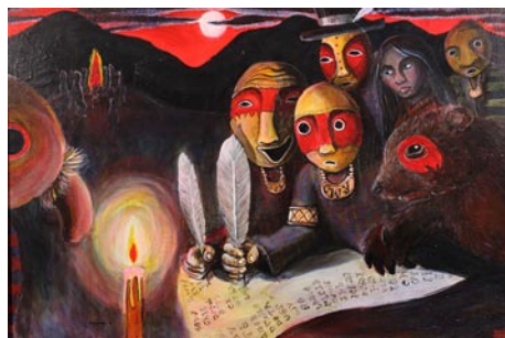
Joseph Erb (Cherokee), “Petition”, acrylic on canvas, 24” x 36”

Our policy at Carolina Arts is to present a press release about an exhibit only once and then go on, but many major exhibits are on view for months. This is our effort to remind you of some of them.