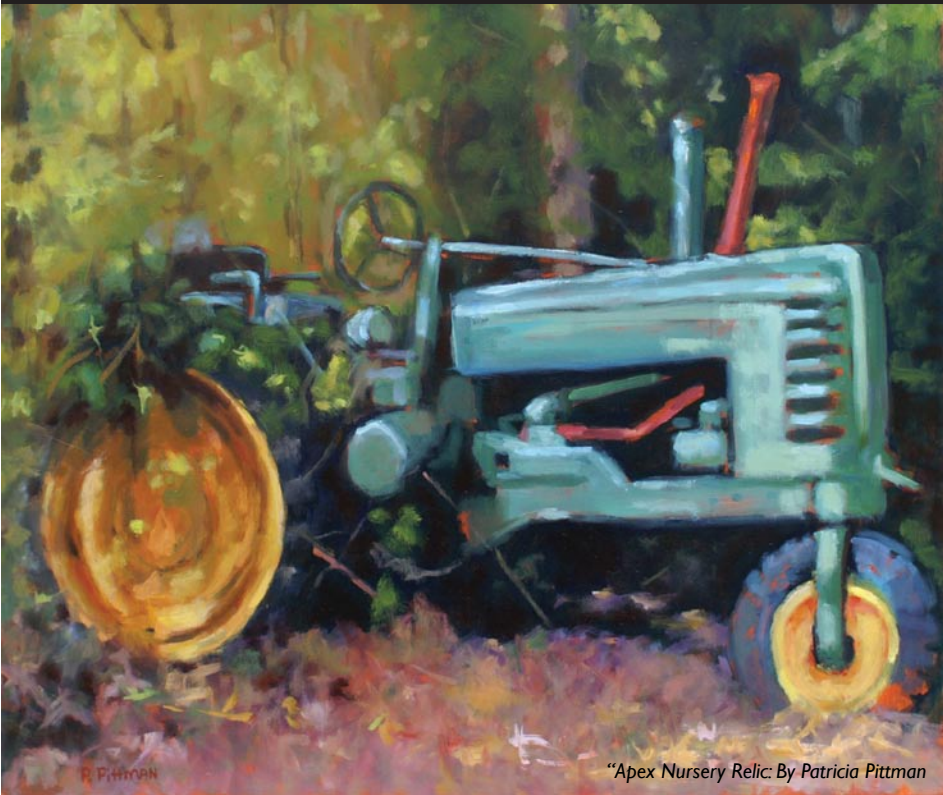
"Apex Nursery Relic: By Patricia Pittman"

323 Pollock Street • New Bern, NC 28560 Hours: Monday - Friday 10:00 am - 6:00 pm Saturday 10:00 am - 5:00 pm • 252.634.9002 www.fineartatbaxters.com