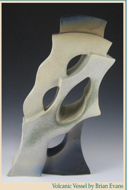
Volcanic Vessel by Brian Evans

10283 Beach Drive SW Calabash, NC 28467 910.575.5999 www.sunsetrivermarketplace.com