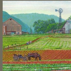
The Delano Amish Community by Wes Siegrist Exquisite Miniatures II