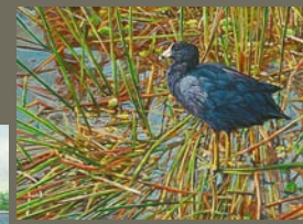
American Coot by Wes Siegrist Exquisite Miniatures II