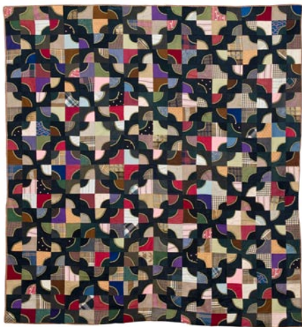
Drunkard's Path quilt, c. 1900.

While mass production and mail order sales of blankets and bedcoverings in the late 19th century might have briefly made the handmade quilt less desirable, women in all walks of life continued to find satisfaction, artistic expression, delight and even comfort in designing and sewing quilts such as those in Early 20th Century Quilts .