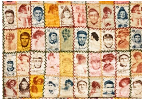
Cigarette Silk quilt, c. 1910.

ing colors, this example has many colorful scraps but relies on the use of black fabrics for its distinctive winding path.