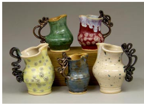
Works from Turtle Island Pottery

Turtle Island Pottery , 2782 Bat Cave Road, Old Fort. Ongoing - Featuring handmade pottery by Maggie and Freeman Jones, who create one of a kind, functional, decorative stoneware items. From cups to umbrella stands, mirror frames and clocks. Sculptural and inspired by nature, many forms are reminiscent of antique pottery from the arts and crafts movement and art nouveau styles. Hours: Showroom open most Saturdays, call ahead for