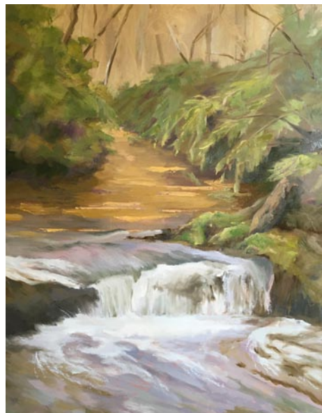
Work by Carol Story

Throughout downtown Spartanburg's Cultural District, Ongoing - The Creative Crosswalk Project is a public art initiative in which local artists and designers design and paint a series of crosswalk murals, transforming the crosswalks into works of art, on Main Street in Spartanburg, SC. The downtown cultural district area is often bustling with events and pedestrians, and the pedestrians rely heavily on a multitude of crosswalks to safely traverse the downtown Spartanburg area. The problem is that crosswalks are incredibly easy to overlook, they are rarely visually appealing, and they can even be quite dangerous. In an effort to remedy these issues, Chapman Cultural Center, the City of Spartanburg, and the Spartanburg Area Chamber of Commerce came together to organize the Creative Crosswalk Project. For more info visit ( https://www.chapmanculturalcenter.org/pages/blog/detail/article/c0/a1555/ ).