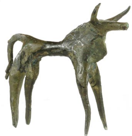
Greek (Olympia?), "Dancing Bull," Eighth century B.C., Bronze. The Sol Rabin Collection

City Gallery at Joseph P. Riley, Jr. Waterfront Park , 34 Prioleau Street, Charleston. Lower Gallery Level, Through Jan. 29, 2023 - "Anonymous Ancestors," featuring an installation by Columbia, SC, artist, Susan Lanz. Hours: Wed.-Sun., noon-5pm. Contact: 843/958-6484 or ( www.charleston-sc.gov/citygallery ).