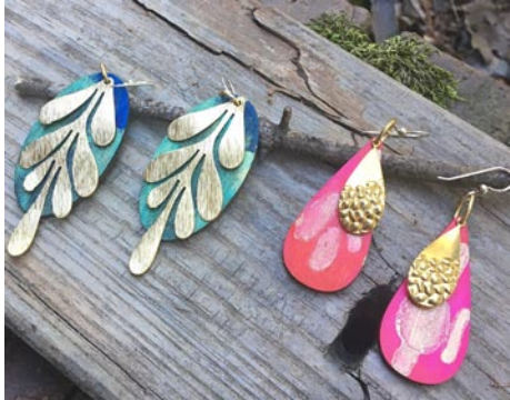
Works by Rosemary McLeod

For further information check our SC Institutional Gallery listings or visit ( artistcollectivespartanburg.org ).