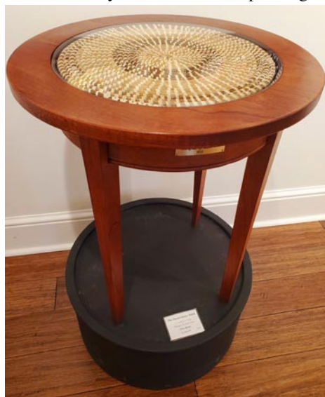
Work by Pete Rock

For further information check our SC Commercial Gallery listings, call the gallery at 843/577-9295 or visit ( lowcountryartists.com ).