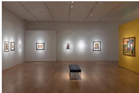
View of the exhibition

In 1928, Florence native William Henry Johnson met Danish textile artist Holcha Krake. It was a chance encounter which opened a new chapter in Johnson's life, both personally and artistically.