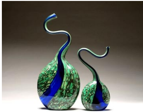
Works by Michael Hatch

media works are intimate, drawing in the viewer. The effect is accomplished through an aura of nostalgia and historical reference, but also her materials and exquisite tints of color. The three women are new arrivals to the Tryon area.