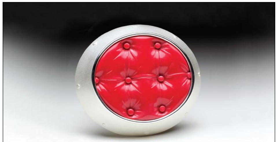
THERE'S A FINE LINE BETWEEN PRICELESS AND WORTHLESS.

All the information will be available at the website, ( www.toeriverarts.org ). The guide will be available at locations around the two counties. For more information, e-mail to ( trac@toeriverarts.org ) or call 828/682-7215.