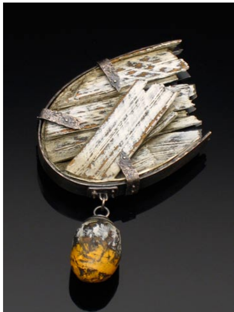
Work by David Clemons

If wood makes the heart pound, carving, furniture, turned wood, inlaid wood, painted wood, or art made with materials gathered from the woods will definitely keep it beating. And all the jewelry. It lights up a room with reflections off precious stones, pearls,