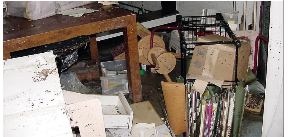
Artist Diane Falkenhagen's Texas studio — destroyed by flooding during Hurricane Ike, 2008

What would you do if you lost your work, your tools, your images, and a lot more to a flood? Metalsmith Diane Falkenhagen knows what five feet of contaminated saltwater can do to a jewelry studio. CERF+ can help you learn how to protect your career from crossing that fine line.