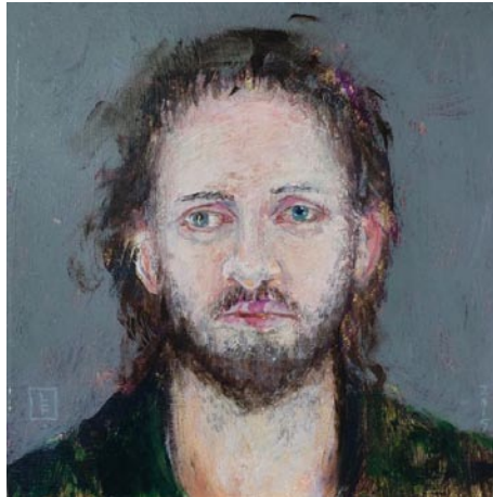
"The Accused - Armed Robbery" 10x10 by Linda Fantuzzo

between expectation and reality in everyday life. Color, beauty and humor come together in this collection of drawings and sculptures and ask us to look for meaning in our daily narratives. For further information call the Gallery at 828/859-2828.