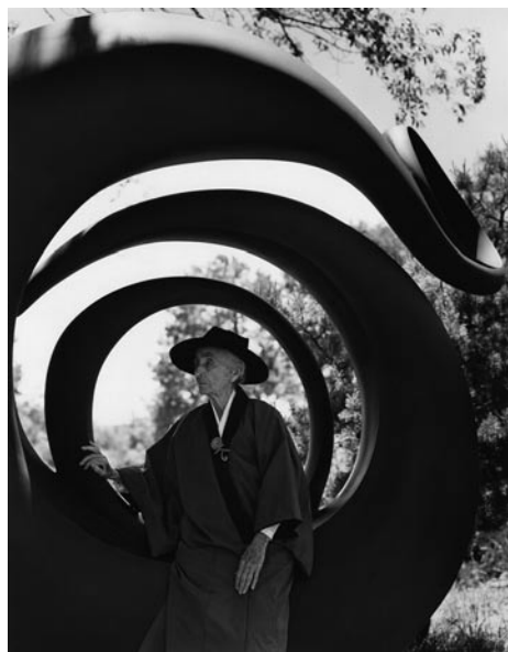
Bruce Weber (American, born 1946). "Georgia O'Keeffe", Abiquiu, NM, 1984. Gelatin silver print, 14 x 11 in. (35.6 x 27.9 cm). Bruce Weber and Nan Bush Collection, New York. © Bruce Weber

The Reynolda House Museum of American Art in Winston-Salem, NC, is presenting Georgia O'Keeffe: Living Modern , on view in the Mary and Charlie Babcock Wing Gallery, through Nov. 19, 2017. Reynolda House Museum of American Art will mark its centennial as an estate and its fiftieth anniversary as a museum with an exciting and timely exhibition of the work of Georgia O'Keeffe. The exhibit explores how the artist's modern sensibility saturated