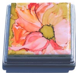
Work by Susan Nern

For further information check our NC Commercial Gallery listings, call the gallery at 910/575-5999 or visit ( www.sunsetrivermarketplace.com ).