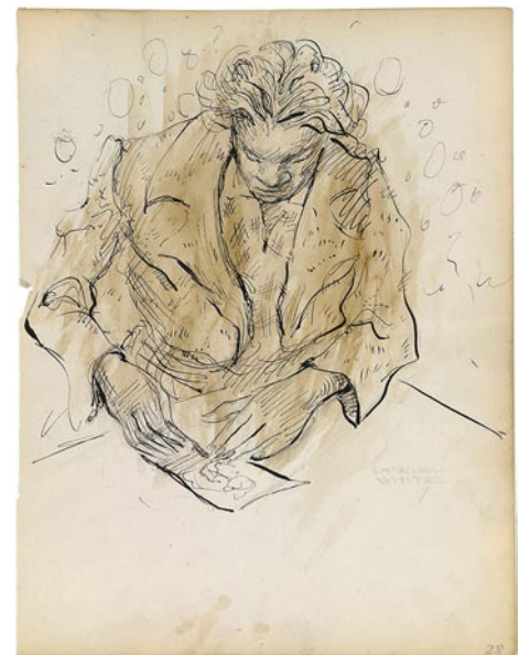
Charles Wilbert White, Jr., Seated Man with Long Hair at Table, c. 1935-38, 10 x 7

to the country's endemic species. On the other hand, the rabbit also represents the fairytale animals from our childhood—a furry innocence, frolicking through idyllic fields. Intrude deliberately evokes this cutesy image with visual humor to lure visitors into the art, only to reveal the more serious environmental messages in the work. For more info check our NC Institutional Gallery listings, call 919/839-6262 or visit ( www.ncartmuseum.org ).