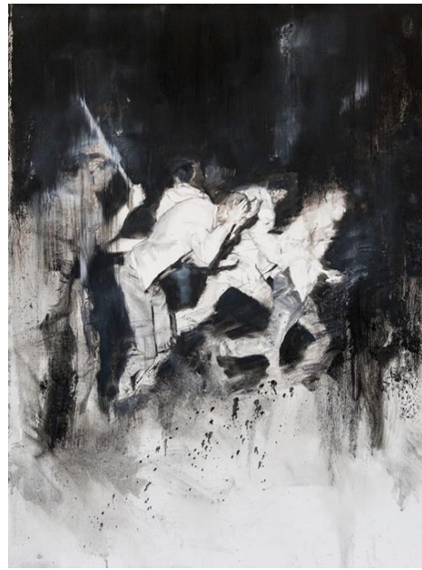
Work by Charles Williams

ful images of stunning people of African ancestry at a time when such images were not in vogue. For further information check our NC Institutional Gallery listings or visit ( www.ellington-white.com ).