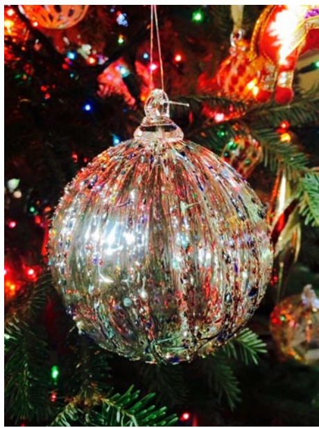
Work by Pringle Teetor

Each holiday season the members of the Hillsborough Gallery of Arts transform the gallery to showcase original ornaments and hand-made gifts. The gallery's 21 members work in a variety of media, providing a wide array of art and fine craft for holiday shoppers. The glass art includes hand-blown vessels, ornaments, solar lights, paperweights, and jewelry. Fiber art on display includes framed collage quilts and hand dyed stitched cloth, knitted scarves; and fabric handbags. The jewelry in the show covers a variety of styles and techniques, from copper and bronze to sterling and fine silver necklaces, earrings, bracelets and rings, some with gold accents and stones. Visitors will also find