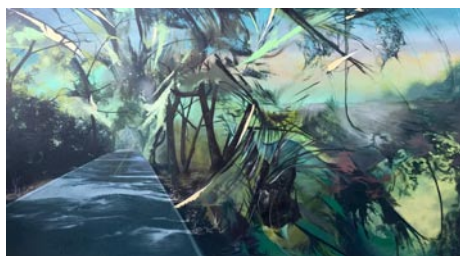
Work by Kolton Miller

ing and painting mediums, I layer line and pigment to capture the authentic in-between moments of life in the American South; the moments before, the moments of, and moments after, in order to initiate the act of looking from all perspectives to discover ourselves in the truth of the world. Chapman’s painting A Good Plenty is a familiar detail of a “mess” of fish, an integral image of the rural South.