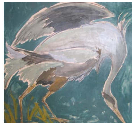
Work by Shannon Whitworth

For further information check our NC Institutional Gallery listings, call the Council at 828/884-2787 or visit ( www.artsobrevard.org ).