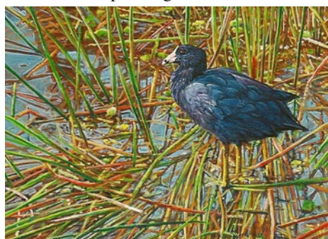
Work by Wes Siegrist

The Yadkin Arts Council in Yadkinville, NC, will present the exhibit, The World in Miniature, Exquisitely , a national touring exhibition of all new works in miniature by the internationally acclaimed husband wife duo of Wes and Rachelle Siegrist, on view in the Welborn Gallery from Nov. 16 through Dec. 22, 2012. A reception will be held on Nov. 16, beginning at 5:30pm. The popular artists will be present at the opening where they will debut 51 new paintings.