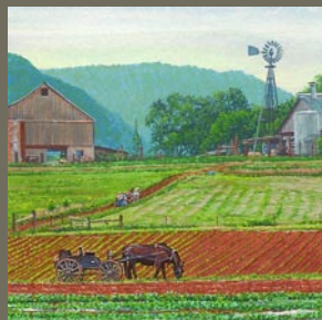
The Delano Amish Community by Wes Siegrist Exquisite Miniatures II