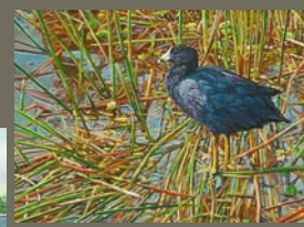
American Coot by Wes Siegrist Exquisite Miniatures II

Through November 9, 2012 Artist Member Exhibit