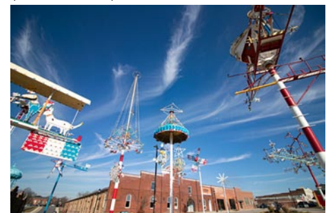
View of Vollis Simpson Whirligig Park

Truist Events Gallery , Wilson Arts Center, 204 Nash Street S, Wilson. Ongoing - We feature a variety of work from local and regionally known artists at the Wilson Arts Center, rotating work approximately every two months. All gallery exhibits and artist receptions are free and open to the public! Visit our Gallery Shop at the Wilson Arts Center, featuring a variety of handmade and one-of-a-kind treasures from local and regional artists! There are two free parking lots behind the Wilson Arts Center: The Colony Lot (Lot #12) with entrance off Barnes Street and Lot #17 with an entrance off Douglas Street. Hours: Tue.-Sat., 10am-5pm. Contact: 252/291-4329 or at ( wilsonarts.com ).