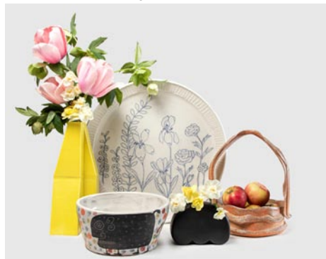
Works from the Spruce Pine Potters Market