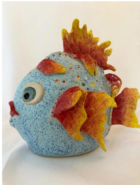
Work by Cat Bradley

New Elements Gallery , 271 North Front Street, Wilmington. Ongoing - Featuring works by regional and nationally recognized artists. We offer a wide variety of contemporary fine art and craft, including paintings, sculpture, ceramics, glass, fiber, jewelry and wood. Hours: Tue.-Sat., 11am-6pm or by appt. Contact: 910/343-8997 or at ( www.newelementsgallery.com ).