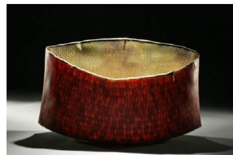
Work by Curtis Benzle

Beaufort Art Association Gallery , 913 Bay Street, across the street from the Clock Tower, Beaufort. Ongoing - New works by more than 90 exhibiting members of the Beaufort Art Association Gallery - exhibits and featured artists change every six weeks. In addition to framed paintings in a variety of media, the gallery offers prints, photographs, unframed matted originals, jewelry, sculpture, ceramics and greeting cards. Hours: Tue.-Sun., 11am-4pm. Contact: 843/521-4444 or at ( www.beaufortartassociation.com ).