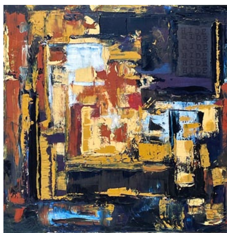
Work by Kimberly Varnadoe

An aesthetic experience can be described as a situation where one loses awareness of the surrounding environment and becomes fully engaged in the symbolic world. Abstraction is a way to focus on the emotional experience rather than the descriptive characteristics of an image.