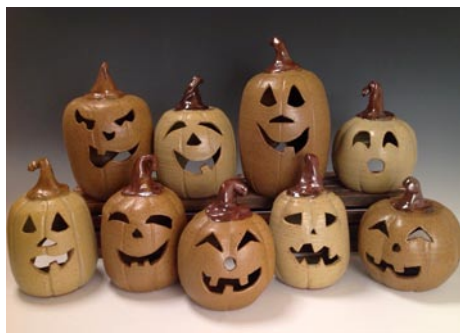
Works from Seagrove Stoneware Pottery

You might think a pumpkin is just a pumpkin, but you will find that these talented artists all have their own unique style and their own handmade seasonal interpretations. Find the latest fall designs, pottery pumpkins, gourds, fall home décor and seasonal tableware for all your baking needs. Each participating shop offers a different experience, so pick up a map and follow the