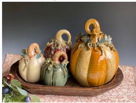
Works from Crystal King Pottery

The Potters' Pumpkin Patch Trail is a self-guided tour of five pottery galleries each offering special Fall themed items throughout the month of October and experiences each Saturday of the month. The Saturday events are hosted by a group of Potters in Seagrove, NC, which include Blue Hen Pottery, Crystal King Pottery, Seagrove Stoneware, Thomas Pottery and The Triangle Studio. Experience Autumn in Seagrove by exploring five individual shops that are featuring Fall themed decorative and functional pottery, festive woodland animal sculptures and their signature ceramic pumpkins and gourds. Spend the day in the country on the Potters' Pumpkin Patch Trail, along the scenic Pottery Highway, and stop in at one of the locations to get a map and list of events. During Saturday events throughout the whole month, visit each participating shop to meet the artists, shop for Fall specialty items, and take part in special activities that vary from location to location.