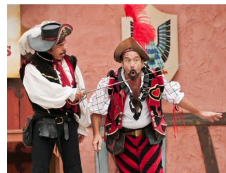
View of the Don Juan & Miguel show

The Renaissance Festival is the largest costume party in the Carolinas. Visitors can come as they are or to join in the spirit by visiting the village in costumes of all types. Each weekend has unique themes with many having costume contests with prizes and discount admission opportunities. Returning popular weekends like Halloween Daze & Spooky Knights, Pirate's Christmas, and Time Travelers' Weekend embrace visitors in non-renaissance costumes such as those dressed as superheroes (and villains) and characters inspired by Harry Potter , Games of Thrones , Lord of the Rings , and more. Visitors can wear their own costumes or acquire them at the village costume rental shop located just outside the Festival gates. Also available for rent are wagons, strollers, wheelchairs. And new for