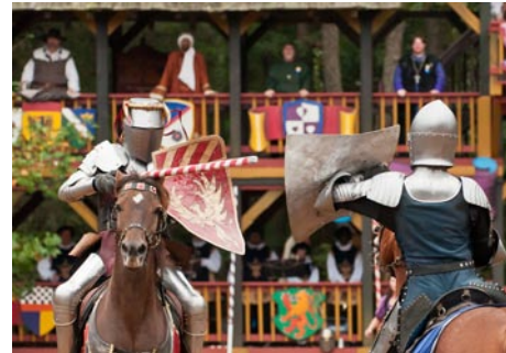
Two Knights just jousting around stage or off.

Each Festival day is filled with an abundance of attractions. The 25-acre village of Fairhaven has sixteen stages packed with costumed performers offering a unique mix of continuous music, dance, comedy, and circus entertainments. Swimming mermaids, Birds of Prey Falconry demonstrations, and the popular Jousting Tournament with horse mounted armored knights battling three times daily are all examples of the endless entertainment options offered. The shows are always spontaneous, and you will never know what happens next, on