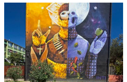
Work by Doug Lockard

Although ‘street art’ comes in many forms, this show will feature about 50 highly diverse fine-art photographs of building-sized painted murals often created by collaborations of several artists. Historically in South America, this art form was dominated by sociopolitical messaging; however today, while the messaging can still be seen, they more typically represent the personal perspective of the individual artist(s) where there is no shortage of diverse imagination. “I've wanted to do this show for a while