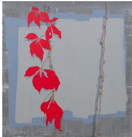
Work by Hannah Cole

The three artists featured in this exhibition all take the source for their respective works from common objects and places in their immediate environment. They paint the things that are often overlooked or not considered interesting or beautiful. They take the time to notice the anomalies in those common scenes around them and use those surprises as the foundation for intriguing bodies of work.