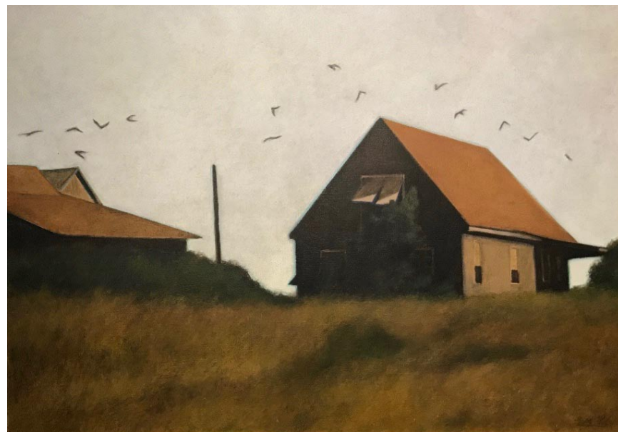
Grass, Sky Outer Bans, NC 1996