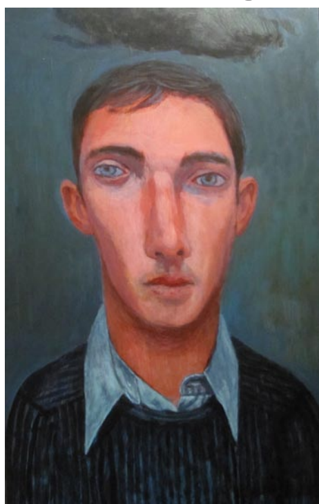
Work by Kevin Isgett

Stories We Tell includes haunting stories like Isgett's "Storm" and loud, intimidating stories like Flowers' "Nothing to See Here (Move Along)" and even humorous stories,