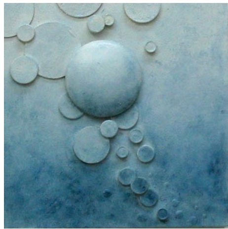
Work by Lolette Guthrie

OCAG's Open Studio Tour is a rare opportunity for art lovers from Orange County and beyond to meet artists in their places of work, to view and purchase art directly from the artist and in many instances to watch as artists demonstrate how they create their pieces. Studio Tour brochures and maps of participants' studios are available at the Hillsborough Gallery of Arts and other area