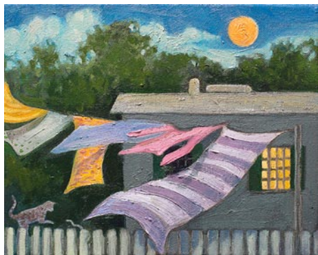
Work by Emily Eve Weinstein

During the Open Studio Tour members open their studios, often located on their own property, to the general public. During a visit members of the community get a chance to meet artists, learn about their creative process first-hand, view their body of work up close, and have the opportunity