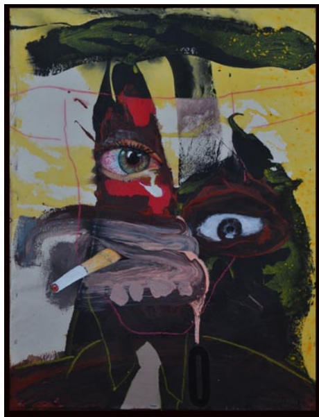
"FaceScapes". This is an acrylic with pastel, 2013-14, 41" x 30". The title refers to Julius Oppenheimer, the American theoretical physicist and professor of physics at UC, Berkley who directed the Manhattan Project during WWII. The result of this project was the creation of the first atomic bomb.