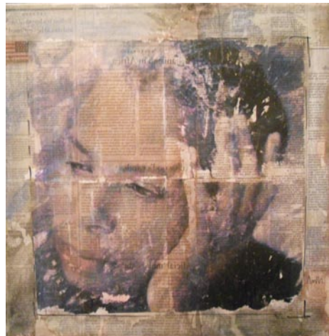
Work by Patricia Frida

For further information check our SC Institutional Gallery listings, call the Museum at 843/238-2510 or visit ( www.MyrtleBeachArtMuseum.org ).