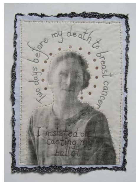
Work by Susan Lenz

Lenz offers the following statement, "From rising to dying, people make decisions. Some are profound; some are routine; some have significant repercussions; others are cause for celebration. In each instance,