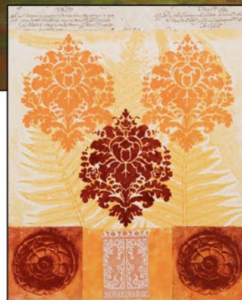
A Certain Glow, Monotype, 30x24

Now on View at the Fine Arts Center of Kershaw County Exhibition continues through October 16, 2013