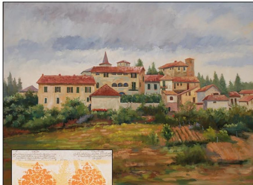
Clouds over Chianti, Oil on Canvas, 36x48