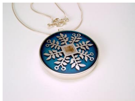
Work by Victoria Varga

In celebration of American Craft Week, Smith Galleries on Hilton Head Island, SC, will feature two special jewelry exhibitions on view through Oct. 31, 2011.